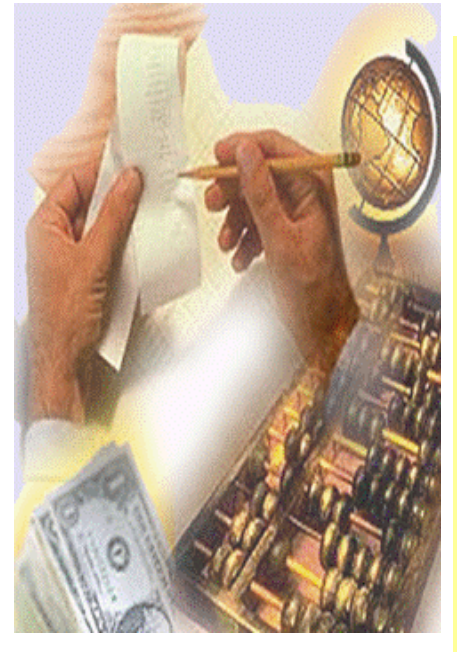
Capri Accounting & Professional Services P Ltd

Capri is a consulting and outsourcing company with global clients. Capri being a one-stop shop solution provider is pivotal to both the established and new businesses. Solutions encompass a wide range of business requirements and complexity. Our practical solution approach with every customer enables us to deliver a solution that is both unique and tailored to their needs, on time and within budget. Team Capri's professional and subject matter specialists provide a world class service.